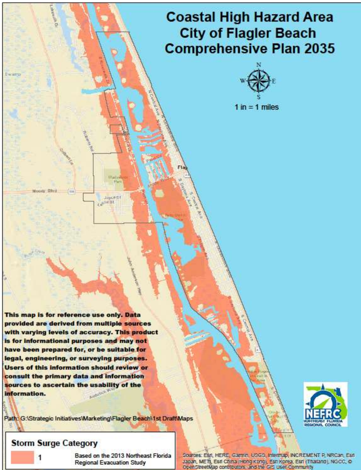
Map 2: Coastal High Hazard Area (CHHA)